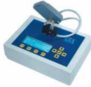
Programming keyboard for transponder and wireless transmission systems; it allows you to personalize installations with fitter/installation codes.