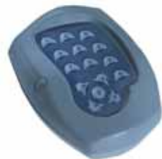
Digikey: Safe and reliable, available wireless and hard-wired.