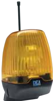
Flashing light with built-in 433,92 Mhz aerial.