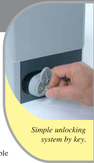
Simple unlocking system by key.