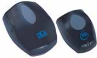
Safety beams: reliable and easy to install.