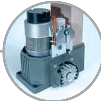
Metal body and highly sturdy components.