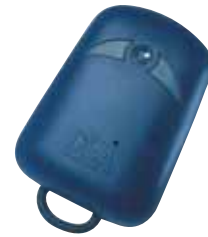
Radio devices: frequency 433,92 Mhz, available Dip-Switch or Self-Learning type.