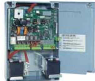
Control boards: 230V a.c. e 24V d.c., exact and simple programming.