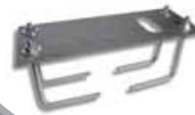
Art. 460 Foundation plate to be placed in the concrete.