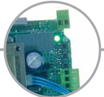
All control boards included in the RR range can be easily programmed through display and 3 buttons.